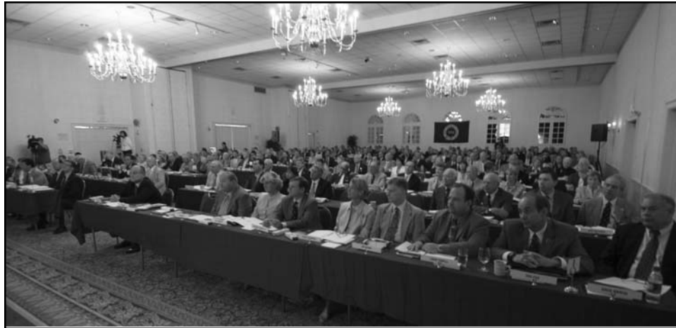
51 st Annual Round Table Conference • August 17, 2003

So I'd like to spend a little time taking your questions about this or anything else you would like to ask me and then maybe make a concluding remark.