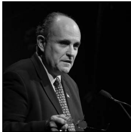
Rudolph W. Giuliani

That’s the approach and philosophy that I brought to New York City. When I became mayor of New York City, it seemed to me that the City of New York needed to be run like an accountable business so that standards were